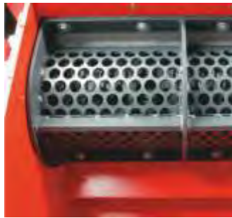
The screen perforation determines the size of the shreds