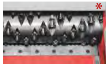
Rotor-Version 7 (40 mm Knife-Ø)