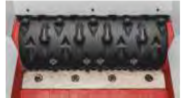
Rotor-Version 8 (30 mm Knife-Ø)

Different rotor diameter: 500 mm, 354 mm and 252 mm for different applications and throughput