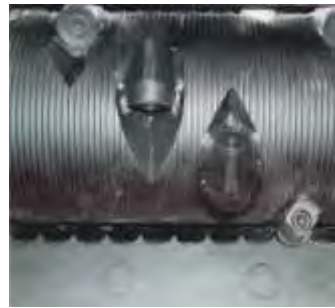
Profil rotor with melded knife holders and 30 mm round knives

This single shaft shredder is the starter model of the single-shaft material shredders with drawer feed. Affordable single-shaft shredder for small quantities of wood waste, with maximum cost-benefit ratio.